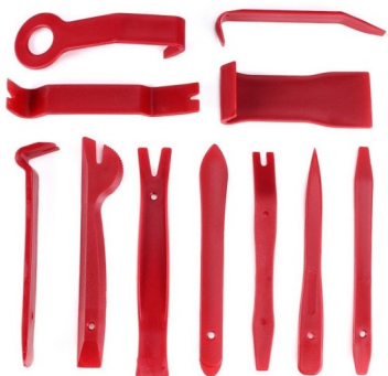
Trim Removal Tools

You will need trim removal tools or a flat plastic knife/spatula.